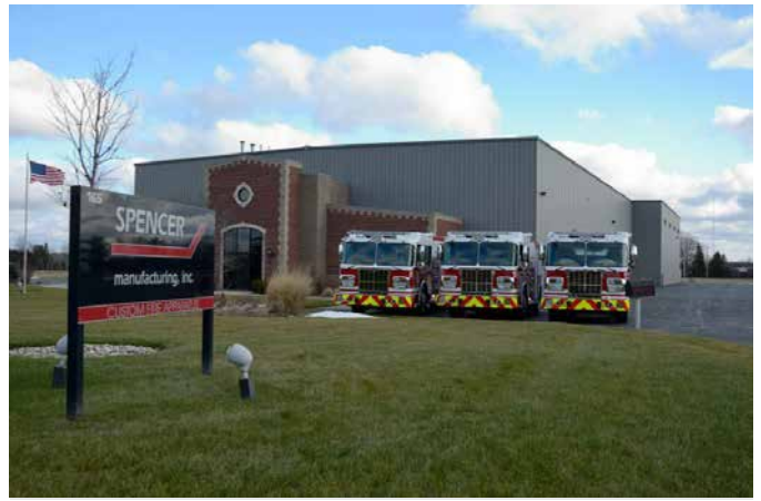
Spencer Manufacturing, Inc. HQ in South Haven Mi.

/ Perfect Welding / Solar Energy / Perfect Charging