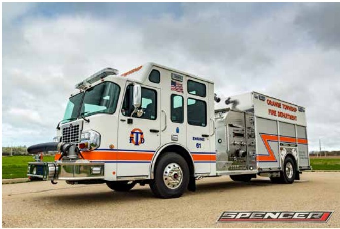
Spencer built pumper/rescue for Orange Township Fire Department, Indiana.

Spencer Manufacturing Ph: (888)439-4884 www.spencerfiretrucks.com